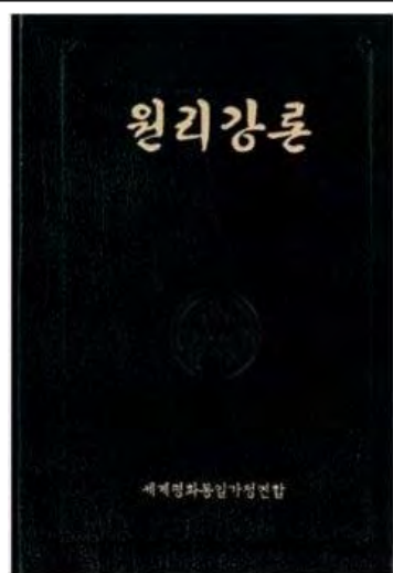
First published in 1966 in Korean: the official version of the Unification Principles , Wolli Kangron. First English version, Divine Principle , appeared in 1973, revised version, Exposition of the Divine Principle , in 1996

In my opinion, The Divine Principle rescues