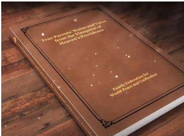
A pre-publication version of "True Parents' Status and Value from the Viewpoint of Heaven's Providence"

It is God who must guide not only the deeds of believers, but also their motivation and emotions, their genuine, unseen self. Such striving for perfection signals the breaking dawn of the Kingdom of God , the first light of the new age of righteousness and justice breaking in upon the earth.