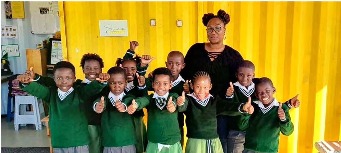
Smart pupils in a photo grab with the teacher at SHINE.