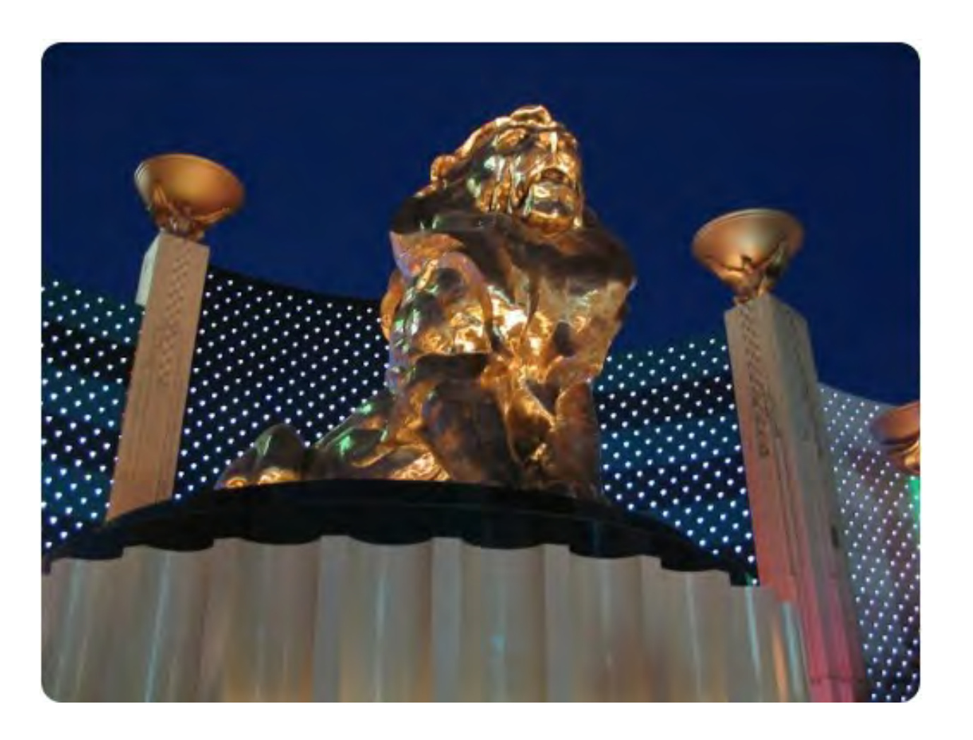
3799 S Las Vegas Blvd Las Vegas, NV 89109