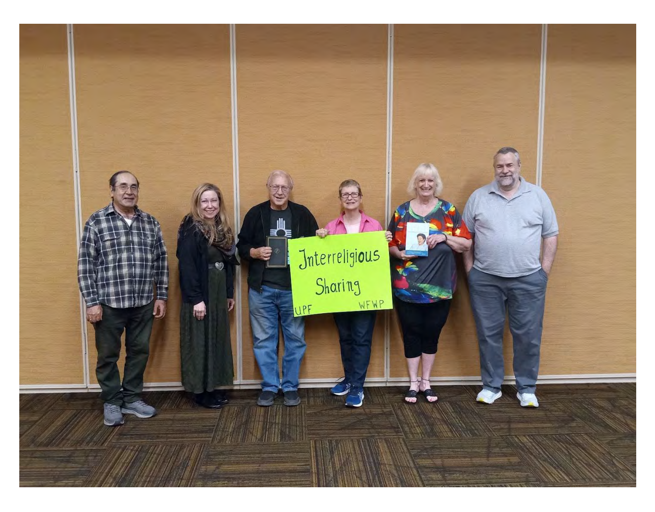
On October 24th, we held our monthly Interreligious Sharing program at the public library. Our theme was, "What Inspires you about Your Faith, Religion or