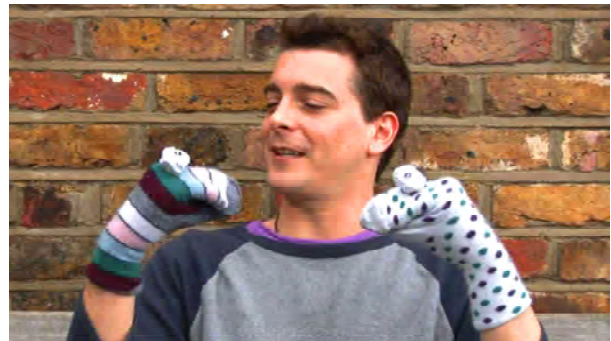
A dialogue between left and right

...and can lead us places we'd have never imagined alone.