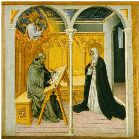
St. Catherine of Siena dictating the Dialogue