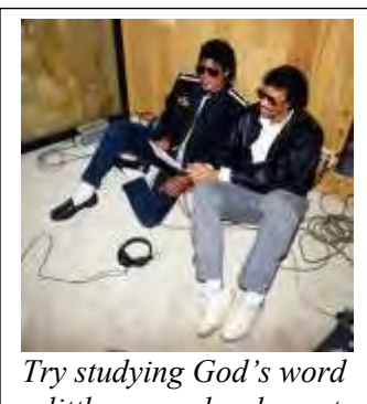
a little more closely next time

As God has shown us, by turning stone to bread So we all must lend a helping hand.