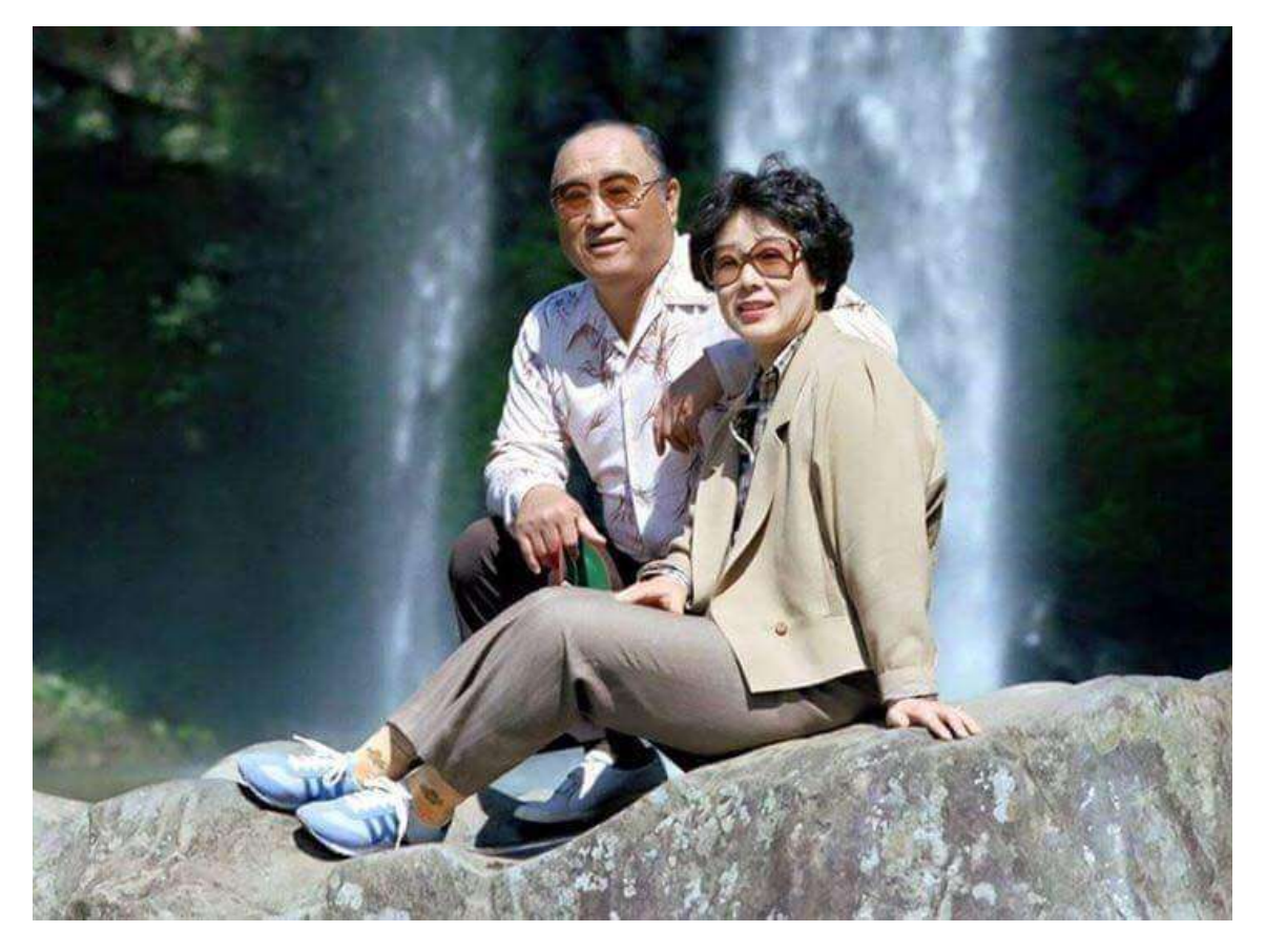
This year, True Parents are celebrating 103rd and 80th