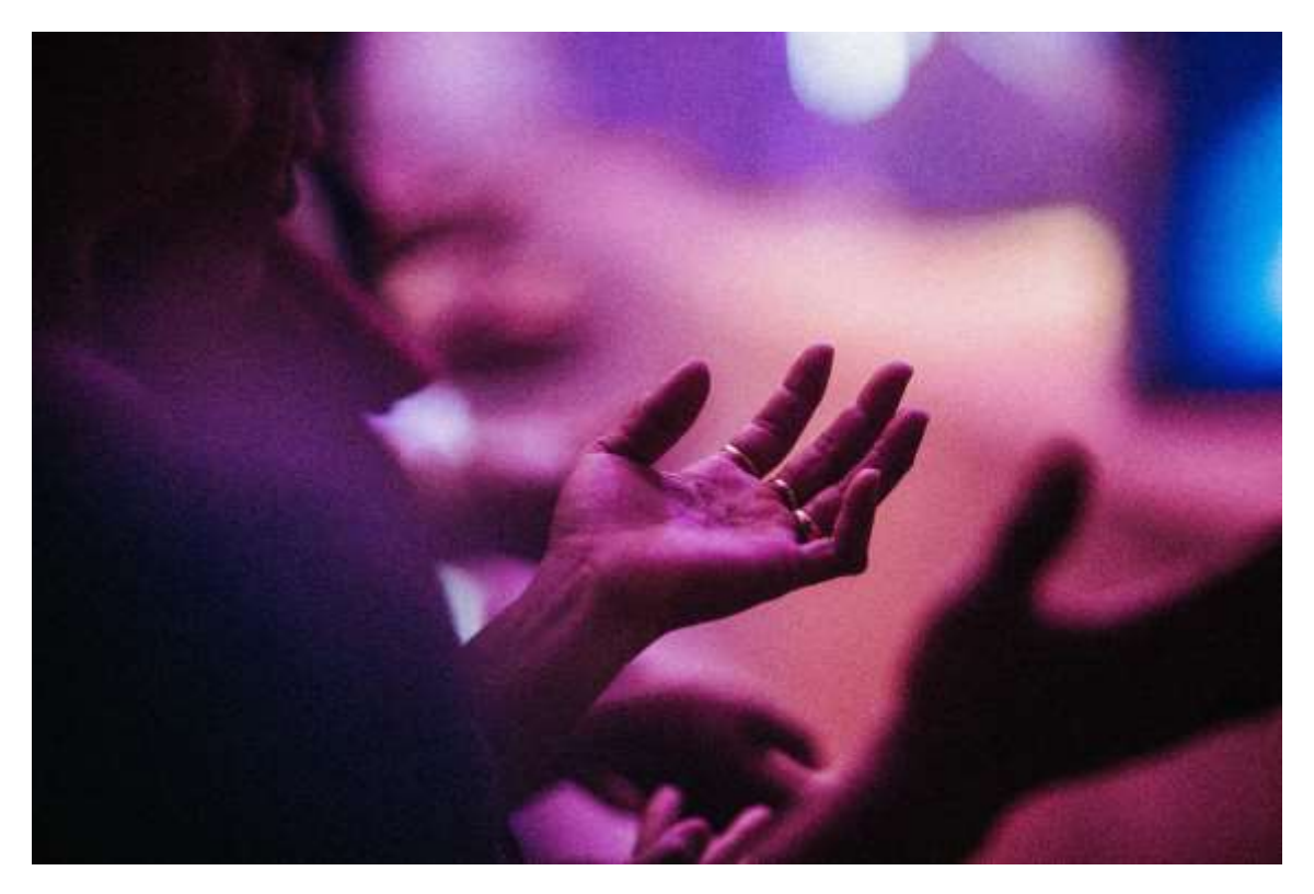
Stay connected by tuning into one of our livestreamed Sunday Services across the nation!