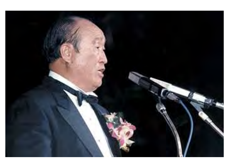
True Father declared that he and True Mother are the True Parents of all humanity at the First World Culture and Sports Festival on August 24, 1992.