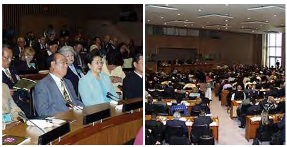
Aug. 18, 2000. True Father proposed the establishment of an interrreligious council within the structure of the United Nations in his keynote address at Assemly 2000.

True Father proposed the establishment of an interreligious council within the structure of the United Nations in his keynote address at Assembly 2000.