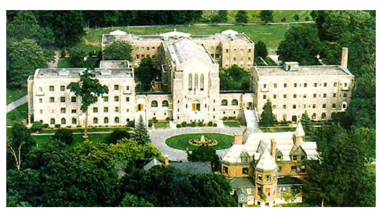
January 21, 1974 HSA-UWC purchased the former St. Joseph's Seminary (UTS)

The former St. Joseph's Seminary, situated on 250 acres in Barrytown, New York, was purchased on January 21, 1974, at a cost of $1.5 million. The property became the Unification Theological Seminary. Also, by 1974, the church purchased nearly 300 acres of greenbelt land in Tarrytown, New York.