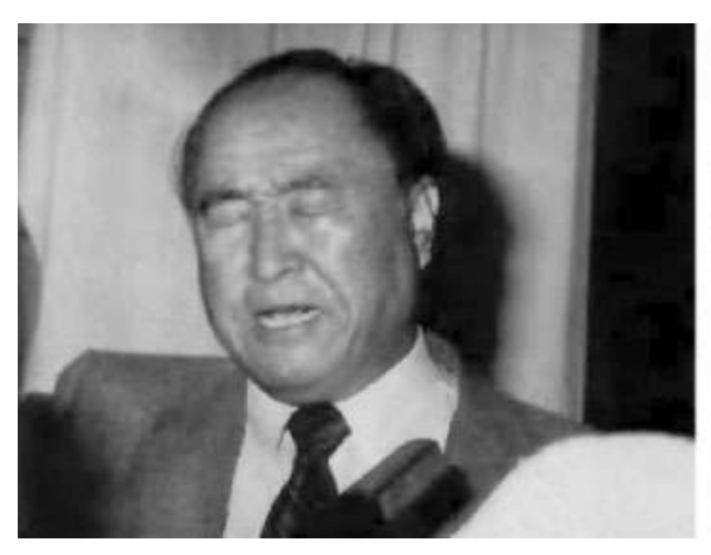
May 20, 1984 True Parents begin the tradition of Ae Chun Candles with blessed families