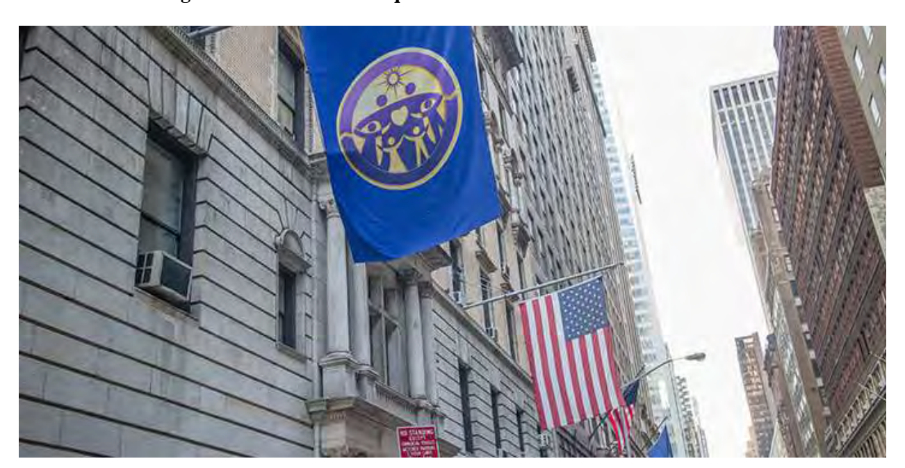
May 18, 1975 43rd street building becomes the new headquarters location

When it was purchased, the building at 4 West 43rd street in Manhattan became the new National Headquarters for what was then known as the Holy Spirit Association for the Unification of World Christianity (HSA-UWC), and enjoyed its first Sunday sermon on May 18, 1975. Today, it also houses the Unification Theological Seminary (UTS) and weekly Sunday Services for the Family Church of New York City (FC NYC).