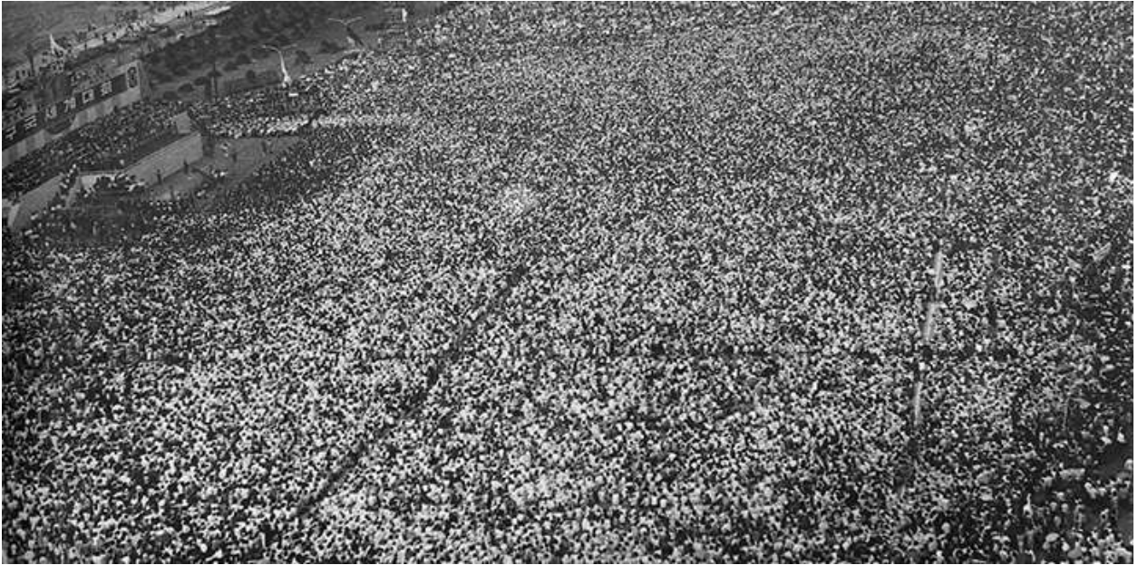
The World Rally for Korean Freedom in Yoido, Seoul

Korean, Japanese, American and European Unificationists who were members of the International One World Crusade (IOWC) distributed some 5 million leaflets, and as many as 1,700 chartered buses were used for transport from local cities and provinces. The rally itself was a staggering spectacle. A million Korean flags were distributed, and 2,400 police were mobilized for crowd control. True Father proclaimed that "enthusiastic youths from 60 different countries" would "defend this country to the last, at the cost of their lives." Noting that "world Unificationists" of the Unification Church regard Korea as "their religious fatherland and holy land," he warned that if "North Korea provokes a war against the South Korean people," his followers would organize a "Unification Crusade Army" and "take part in the war as a supporting force to defend both Korea and the free world."