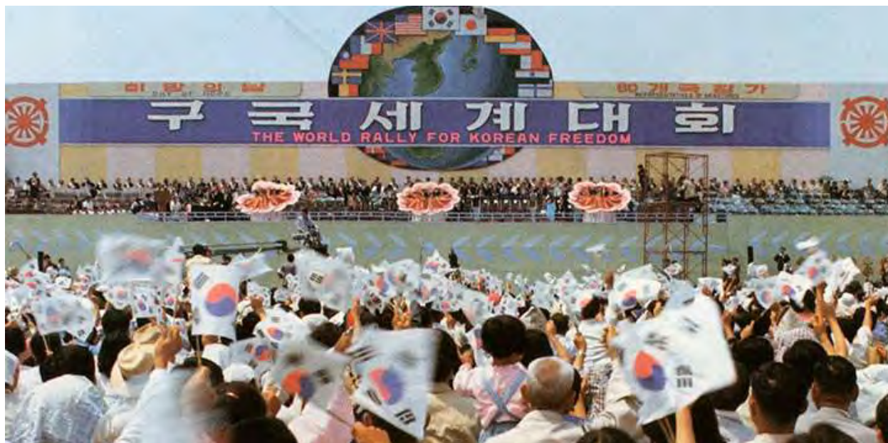
Audience members at the World Rally for Korean Freedom.

The World Rally for Korean Freedom, sometimes referred to as the Yeouido Island Rally, was held on June 7, 1975. True Father spoke on " Korea in the World " to a crowd that was estimated at between 600,000 and 1.2 million on the Yeouido Island Plaza in Seoul.