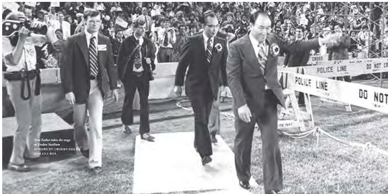
True Fathers takes the stage at Yankee Stadium.

Unificationist shares a brief anecdote about the day of the speech.