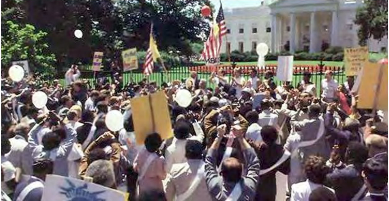
The Rally for Justice and Religious Freedom took place on June 25, 1985

More than eleven hundred ministers from a broad range of denominations gathered from around the country in Washington, D.C., to affirm religious freedom and protest the unjust imprisonment of True Father at Danbury Federal Penitentiary. The rally was sponsored by the Coalition for Religious Freedom and the University Alliance for God and Freedom. Across from the White House, several ministers held handcuffed arms high in the air and a mock jail cell held a gagged woman dressed in white with an inscription that read, "Lady Justice Imprisoned by Blind Government Officials." This was one of a series of rallies and conferences that led up to True Father's release on August 20, 1985.