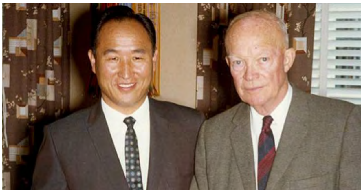
True Father and President Dwight D. Eisenhower