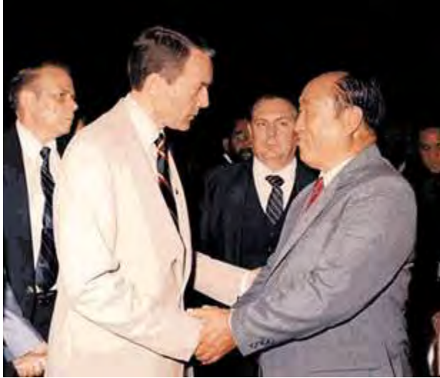
After the Senate Judiciary Subcommittee on the Constitution hearing, Sen. Orrin G. Hatch and True Father shake hands