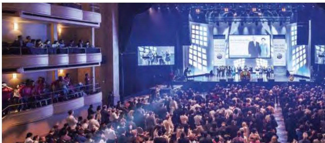
The National Memorial Service took place in the 12,000-square-foot Hammerstein Ballroom.