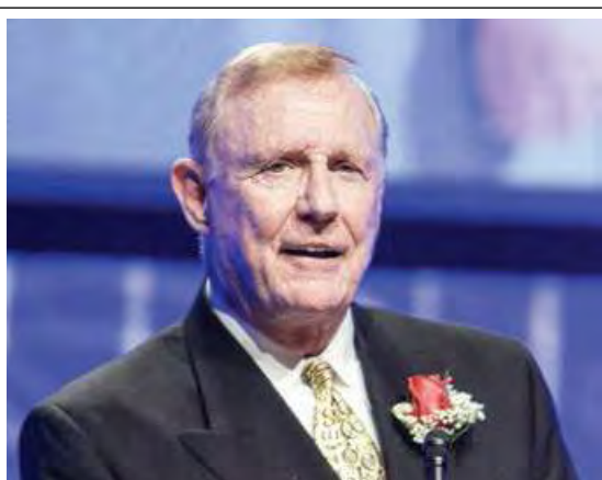
Mr. Dan Burton, a congressman, expressed regret over Father's incarceration in the United States