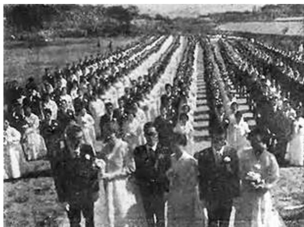
Rehearsal of the International Wedding Ceremony of 777 couples at Sutaek-Ri

True Parents presided over the first truly international Holy Marriage Blessing when they blessed 777 couples on October 21, 1970. As part of the 430 Couples Holy Marriage Blessing in 1968, True Parents blessed 43 non-Korean couples overseas in 1969. For the 777 Couples Holy Marriage Blessing, participants came from 10 nations to Korea. The Marriage Blessing was conducted at Seoul’s Changchung (Metropolitan) Gymnasium in the presence of over 15,000. True Father stated that this was the last Marriage Blessing that he would conduct “before globalizing my mission.” He noted that the 777 Couples Holy Marriage Blessing was the seventh following True Parents’ Holy Wedding. This Marriage Blessing lay the foundation for the Unification Church to work on the worldwide level. “What belongs to Korea,” he said, “can now belong to the world and vice versa.”