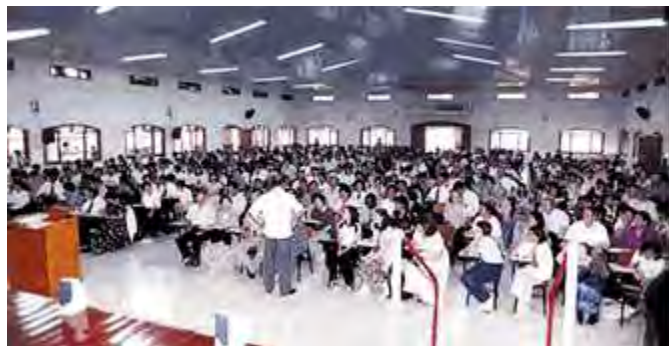
True Father speaks at New Hope Farm in Uruguay

River divides the continent east and west and the Amazon divides it north and south, but that their sources were only four kilometers apart. He envisioned that area being preserved as a “place of encounter where God, people and all things meet in a New Eden.” He also envisioned representatives of the nations settling along the banks of the two rivers. In pursuit of this, True Father set out by boat on the Paraguay River in mid-summer. According to a travel companion: “Every 50 kilometers we set out a sign numbered on a stick. . . . It was not easy to do that, because it is swampy ground covered with growth, and we had to clear the area; walking through the water and getting bitten by bees and ants. We set 63 signposts along the Paraguay River.”