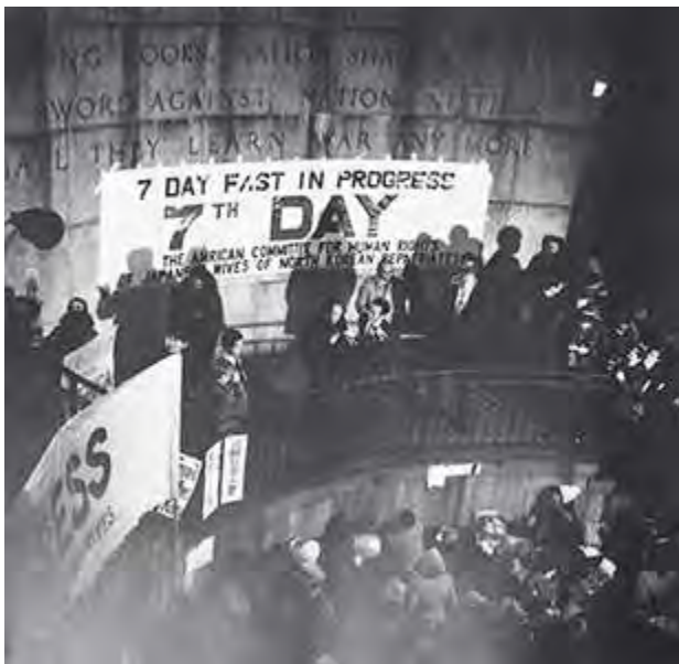
True Father speaks at the conclusion of the 7-day fast

In this connection, the Unification Church published a volume of testimonies from these women, If I Had Wings Like a Bird, I Would Fly Across the Sea , which publicized their plight. Apart from the humanitarian issue, Unificationists undertook the fast within the context of a North Korean proposal, which had gained traction in the UN General Assembly, that called for UN forces to be removed from South Korea. True Father stated that the fast's purpose was to "make naked the evil reality of what they are doing in North Korea and in all the communist regimes." Unificationists' efforts continued after the fast, and on December 9, 1974, the UN General Assembly approved a U.S.-sponsored resolution providing for maintenance of the United Nations Command in South Korea.