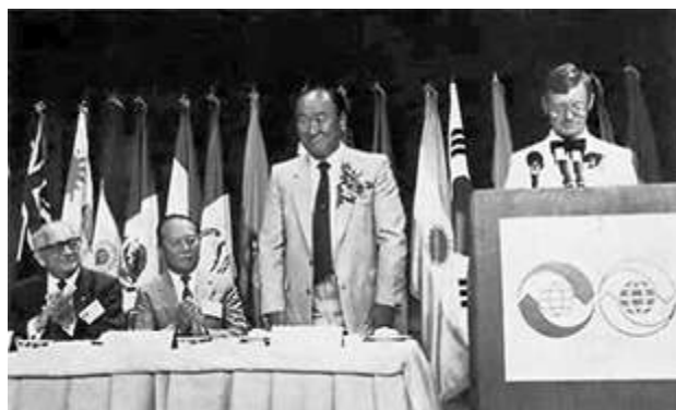
In its sixth year, the World Media Conference, held in Cartagena, Colombia, was the largest and most successful gathering in its history

Having experienced the "awesome power" of the media "to create or to destroy," True Father established the World Media Association to advance the cause of world peace by championing freedom and moral responsibility in the press. The association convened the first World Media Conference in October 1978 at the Waldorf-Astoria Hotel in New York, under the theme "The Future of the Free Press." Thirty-eight journalists from sixteen countries participated. The association continued to sponsor World Media Conferences and associated "fact-finding" tours for journalists throughout the 1980s. The sixth conference, held in Cartagena, Colombia, in September 1983, brought together six hundred media representatives from ninety-two countries. The conferences culminated in the 11th World Media Conference, which was held from April 9 to 13, 1990, in Moscow. The conference, jointly sponsored with the Soviet Union's Novosti news agency, resulted in True Parents' private audience with Soviet President Mikhail Gorbachev.