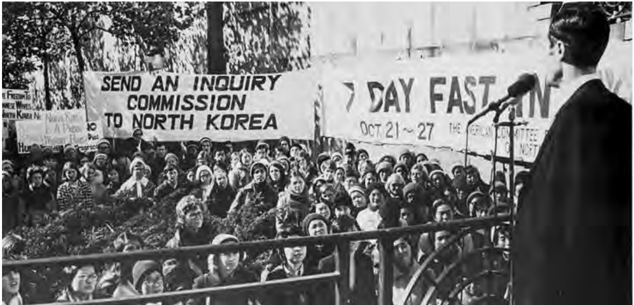
Protestors hold a 7-day fast on behalf of wives in North Korea

In this connection, the Unification Church published a volume of testimonies from these women, If I Had Wings Like a Bird, I Would Fly Across the Sea , which publicized their plight. Apart from the humanitarian issue, Unificationists undertook the fast within the context of a North Korean proposal, which had gained traction in the UN General Assembly, that called for UN forces to be removed from South Korea. True Father stated that the fast's purpose was to "make naked the evil reality of what they are doing in North Korea and in all the communist regimes." Unificationists' efforts continued after the fast, and on December 9, 1974, the UN General Assembly approved a U.S.-sponsored resolution providing for maintenance of the United Nations Command in South Korea.