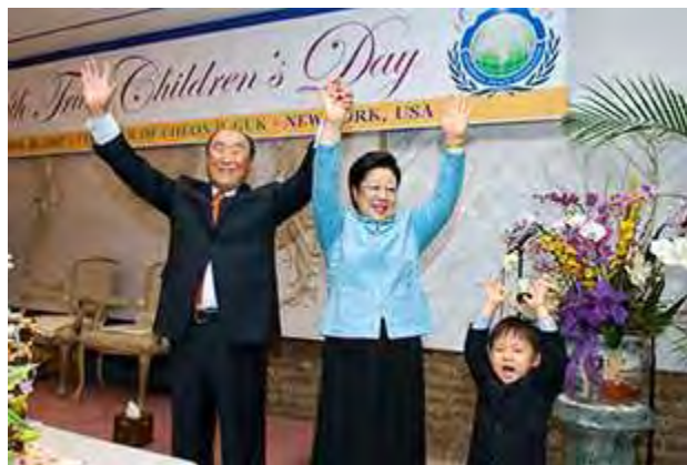
True Parents celebrate the 48th Children's Day and cheer with their grandson

True Father established Children's Day at the former headquarters church at Cheongpa-dong in Seoul on October 19, 1960 (October 1 lunar). It was the second major Holy Day established by the church, following Parents' Day, which had been declared on March 1, 1960 (lunar). Children's Day signified the restoration of God's direct lineage and opened the way for humanity to be engrafted into that lineage as God's sons and daughters. Children's Day continued to be celebrated annually according to the lunar calendar. At the 35th Parents' Day in 1994, True Parents directed that the word "True" be placed before the names of the four major Holy Days (God's Day, Parents' Day, Children's Day and Day of All Things). Thenceforth, the day has been observed as True Children's Day.