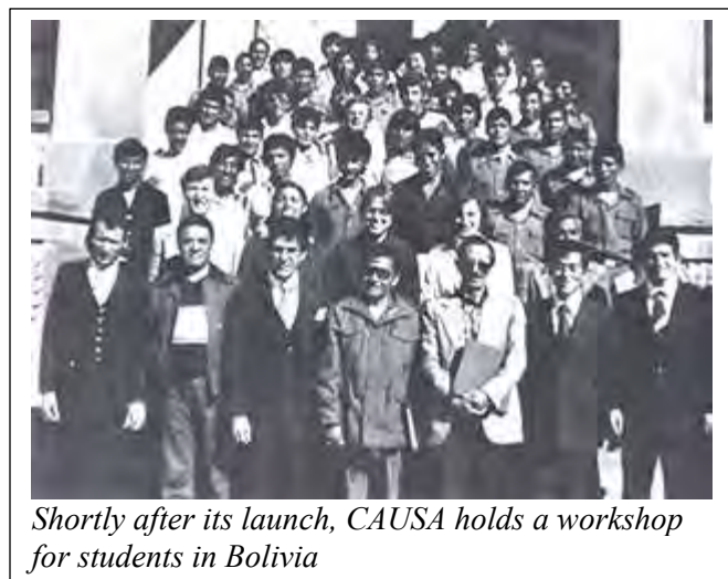
Shortly after its launch, CAUSA holds a workshop for students in Bolivia