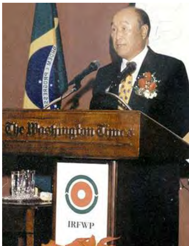
True Father speaks at the IRFWP conference

religious assembly, or council of religious representatives, within the structure of the United Nations” less than two years later at Assembly 2000.