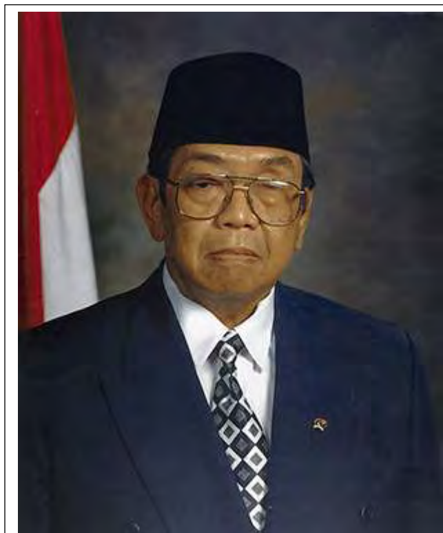
Former President of Indonesia, Abdurrahman Wahid, met with True Father at the World Summit of Muslim Leaders

A little more than a month after the tragic events of 9/11, True Father hosted Assembly 2001, “Global Violence: Crisis and Hope,” in New York City from October 19 to 22, 2001. It convened 380 political and religious leaders from 101 nations. During the conference, True Father met with Abdurrahman Wahid, the former president of Indonesia and longtime head of the Nahdlatul Ulama, the largest independent Muslim organization in the world. True Father also met with Nation of Islam leader Minister Louis Farrakhan and urged the two to work together. A month later at a breakfast meeting with Unificationist leaders, True Father suddenly insisted, “Muslims should hold a peace meeting before the end of the year. Ask H.E. Wahid and Minister Farrakhan if they will convene such a conference. I will help if needed.” Dr. Frank Kaufmann reported, “Within 22 days, 180 Muslim leaders from 51 countries sat in the ballroom of the newly opened JW Marriott Jakarta to welcome speakers for the opening plenary of the World Summit of Muslim Leaders discussing Islam and a future world of peace.” Minister Farrakhan and H.E. Wahid acted as co-conveners ably supported by IRFWP staff.