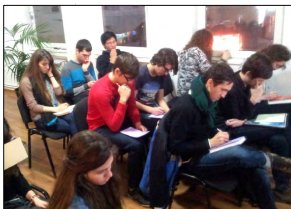
Making 'gift list' for future spouse

Sexual Purity is the best Gift for future spouse! All the participants were encouraged by this presentation and we