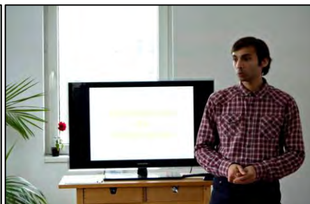
Divine Principle lectures