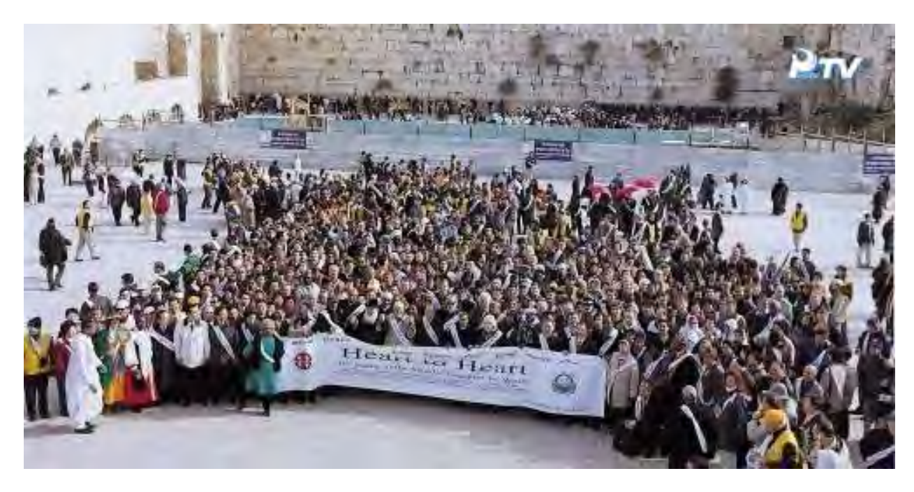
True Mother's World Speaking Tour: Beijing, China December 23, 1992, Beijing, China

True Mother's Beijing Rally was held in commemoration of the establishment of the Women's Federation for World Peace on December 23, 1992 at the Great Hall of the People in Tiananmen Square. True Mother gave a speech titled "Women's Role in World Peace," the first Korean woman to give a speech in the Great Hall. 400 members of the Wives' Association of the Great China listened attentively. On the 22nd, the day before the event, True Mother met Deng Pufang, the eldest son of Deng Xiaoping who at the time was the most powerful political figure in China, and discussed about the mutual cooperation between the two nations.