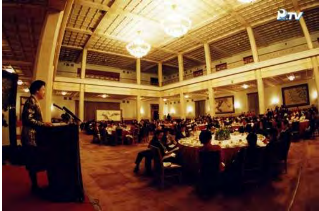
Conclusion of True Father's 40-city Speaking Tour in the United States December 23, 1974, Las Vegas, USA

True Father's 40-city Speaking tour in the United States came to a close on December 23, 1974. Under the theme, "The Future of Christianity," he toured 32 cities from February 16 and an additional 8 cities from September 18. In his speeches True Father emphasized that Christianity has had a faith that waited for the Christ for 2,000 years, but now is the Last Days. Christians should no longer simply believe but must prepare to receive the returning Lord.