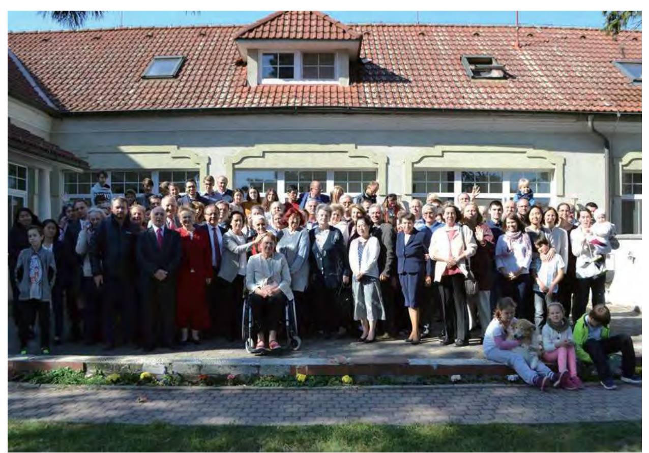
Members today of FFWPU in Slovakia and the Czech Republic recognized fifty years of faith and perseverance