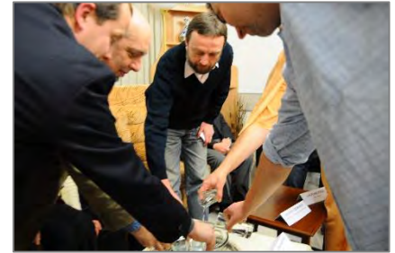
After the presentations of the speakers there was a ceremony of pouring water into one common bowl symbolizing unity of all religions.

is the same and in the course of history the founders of religions could catch some part of it. The religions should not fight against each other. He mentioned also the words of Rev. Moon who said that God is not sectarian and wants to embrace all the people of the world.