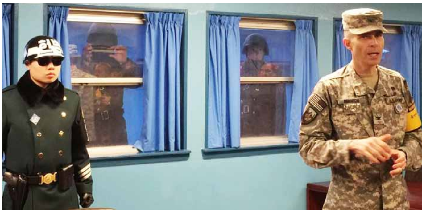
The Washington Times fact-finding delegation toured Pan Mun Jom, the village that straddles the DMZ.