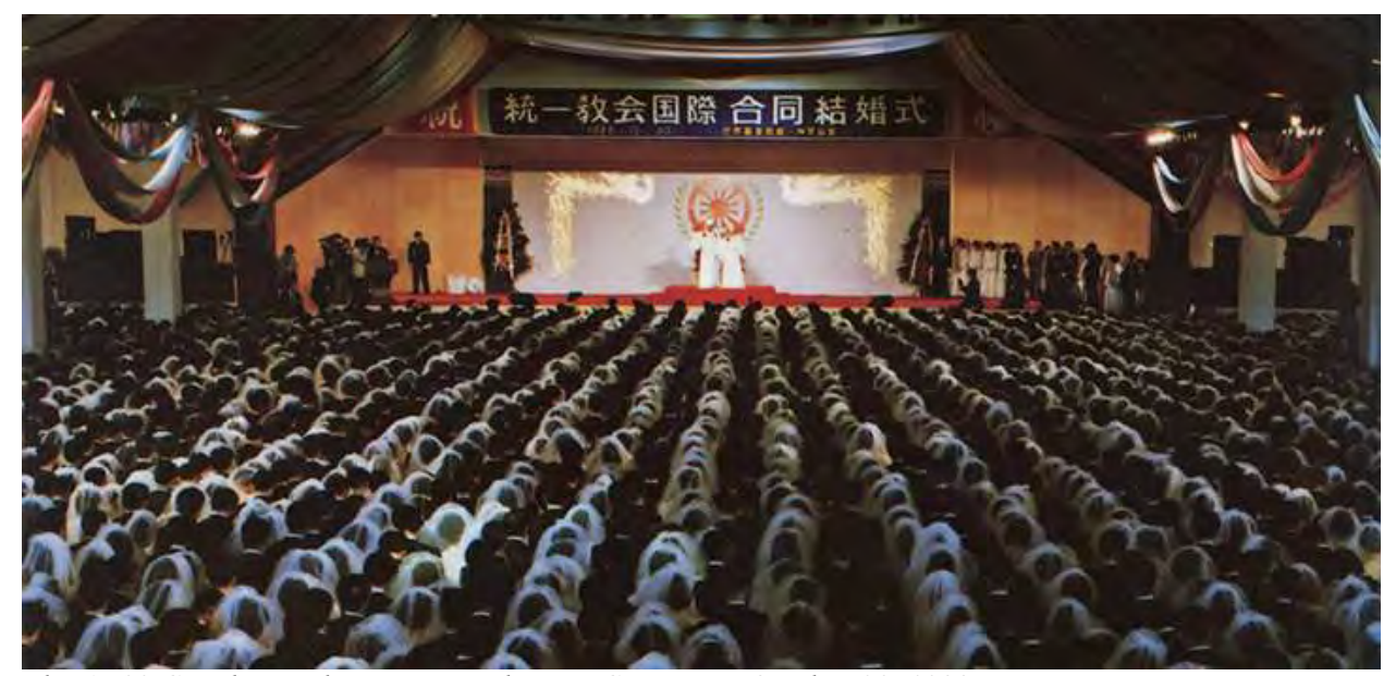
The 6,500 Couple's Holy Marriage Blessing Ceremony, October 30, 1988

On October 30, 1988, True Parents blessed in marriage 6, 516 couples in a Holy Marriage Blessing Ceremony conducted in the complex of Ilhwa Pharmaceutical's McCol soft drink factory in Yong-in, Korea. This Marriage Blessing was significant in that it brought together some 2,500 Korean/Japanese couples. As True Father noted, "Korea and Japan have been enemies for a long time, and their animosity has never been healed. Through this matching ... emotional strains and hurt will be removed ... the fortunes of these two nations will begin to take root on earth." True Parents conducted the Marriage Blessing on the foundation of the recently completed Seoul Olympics and declaration of "The Nation of the Unified World." It was the ninth providential Marriage Blessing following True Parents' Holy Wedding and the Marriage Blessings of 3, 36, 72, 124, 430, 777, 1,800 and 8,000 couples.