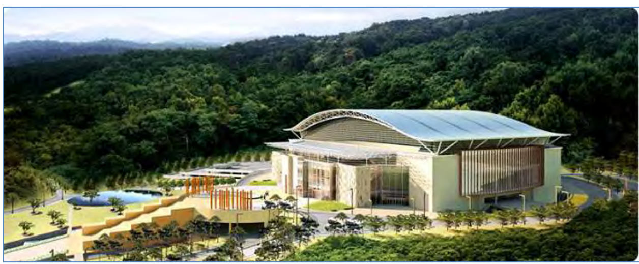
Cheongshim Peace World Center under Construction

Three thousand people attended the groundbreaking ceremonies for the Cheongshim Peace World Center on October 28, 2008. Designed to hold 25,000 people, it was created to be the largest and most sophisticated multipurpose cultural center in South Korea, eight times larger than the Sejong Center for the Performing Arts and twice as large as the Olympic Gymnastics Hall, both located in Seoul. With three floors underground and four floors above, it was designed to be the first Korean arena with folding chairs, a state-of-the-art moving stage and an audiovisual system to host an array of events including concerts, business conventions, corporate events, indoor sports competitions, educational events, expositions and television commercials. The arena would take three years to complete and addressed True Father's longheld desire to see an iconic center for global culture near Chung Pyung Lake.