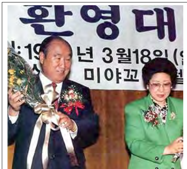
True Parents receive flowers at the San Francisco public speech to the Korean community on March 18, 1990

True Father launched his first U.S. speaking tour since the 1970s, addressing Korean communities in five U.S. cities, beginning in San Francisco on March 17, 1990. The other cities were Los Angeles, Chicago, Washington, D.C., and New York, and True Father said the five cities represented the 50 states of America. True Father spoke on the topic "True Unification and One World." The events were promoted as "Welcoming True Parents Rallies." They served to introduce True Parents' activities and thought to Koreans in America and to familiarize the Korean community with the term "True Parents." True Father had conducted "Welcoming True Parents" rallies in five Korean cities the previous month. These rallies were part of the lead-up to the Moscow Rally in April 1990 and True Parents' declaration of their roles on the worldwide level.