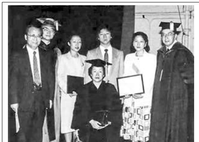
True Mother accepts an honorary doctorate on True Father's behalf from Shaw Divinity School in North Carolina