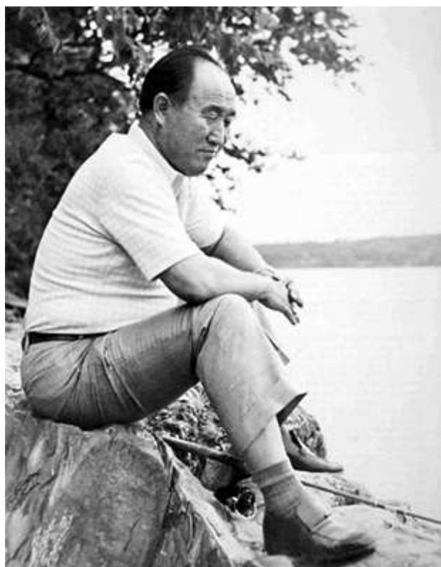
True Father fishing on the Hudson River near the Unification Theological Seminary (UTS) circa February, 1980.