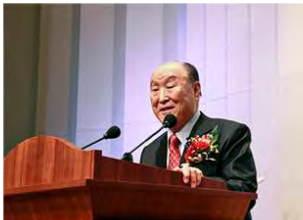
True Father at the opening of the Cheon Bok Gung

True Parents dedicated the Cheon Bok Gung, or "Unification Peace Temple," on February 21, 2010. In 2008, True Father had called for the establishment of a 20,000-member church in Seoul that would serve as a platform to influence the nation. He later increased the goal to a 210,000-person congregation that would influence Korea and eventually the world, not just socially and culturally but also spiritually. Efforts to construct a "growth-stage" Cheon Bok Gung began in earnest with the acquisition of a large public building in Seoul's Yongsan district. The church's worldwide membership, led by Japan and Korea,