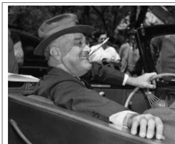
Ponder the enigma of a Democrat-loving God.

Let’s all remain calm. Let’s suppose for a minute we’re all in this together.