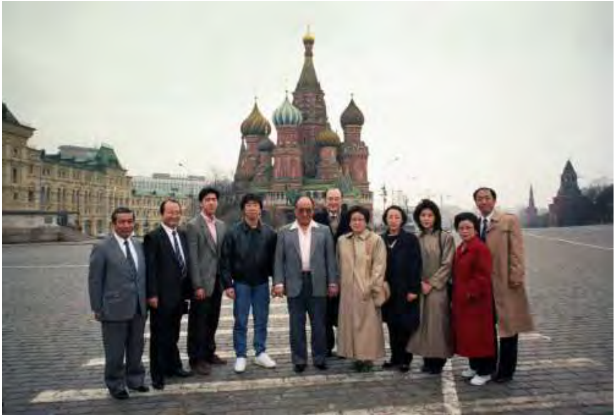
True Parents, True Family and entourage sightseeing in Red Square after meeting President Gorbachev