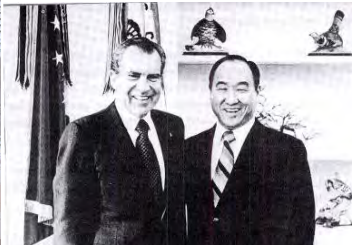
Rev. Moon with Pres. Eisenhower in 1959, and with Pres. Nixon in 1974