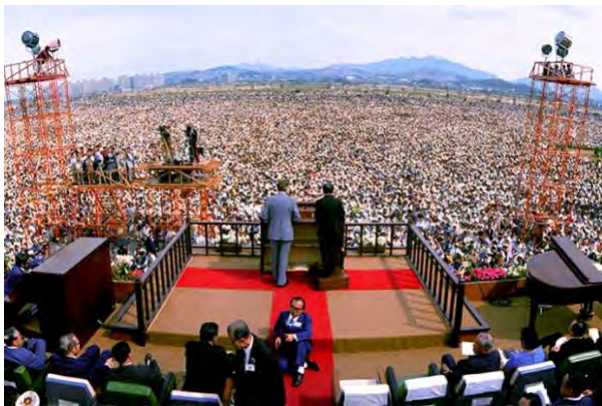
Rev. Billy Graham at Yo-i-do in Korea 1973

Perhaps the most well-known of these world-level preachers was Billy Graham (1918-2018). Billy Graham was born two years prior to True Father, the Rev. Sun Myung Moon. Graham preached to 210 million people in 85 countries on 6 continents. His largest crusade was at Yo-i-do plaza outside of Seoul, Korea, where he spoke to an estimated 3.2 million people, most of whom traveled by foot, over a period of 5 days. People started arriving at 4:30 a.m. He was deeply moved by their fervent faith. On the final day of the crusade, June 3, 1973, 1.1 million people attended the event. Rev. Moon also spoke at Yo-i-Do plaza in June of 1975, in front of 1.2 million people.