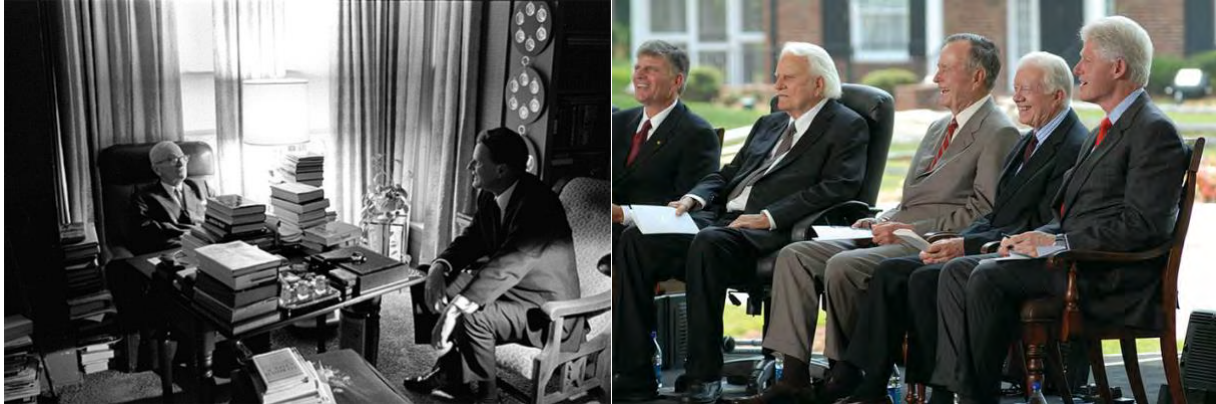
Rev. Graham meeting with US Presidents Harry Truman, George H. W. Bush, Jimmy Carter, Bill Clinton