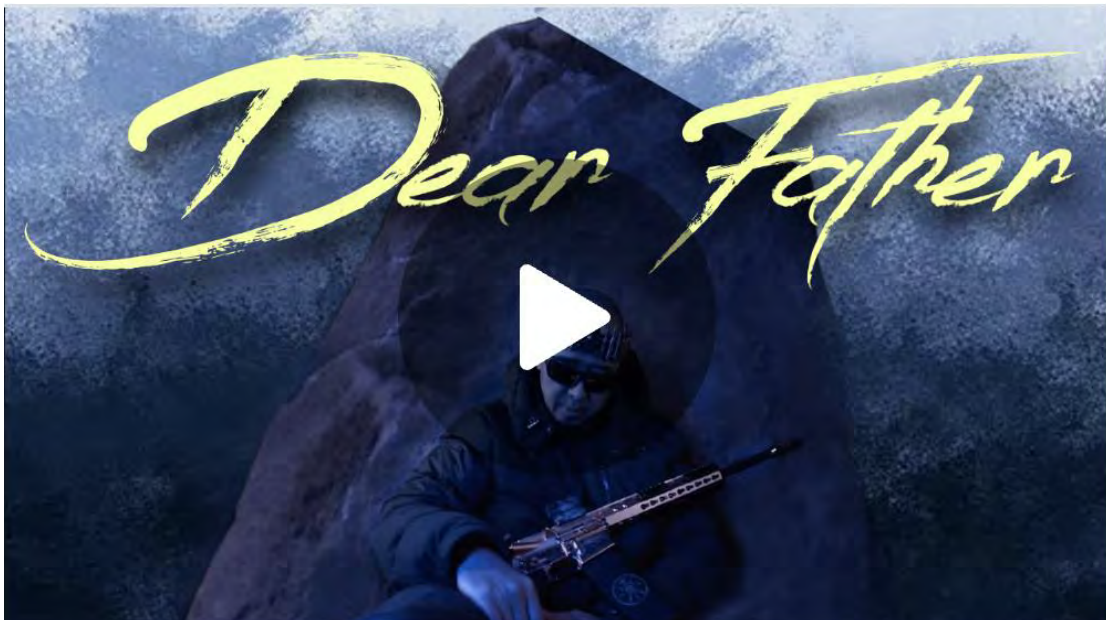
Dear Father Music Video