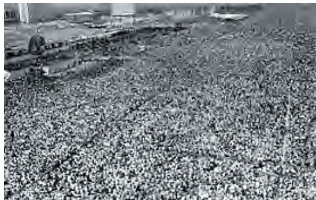
Rev. Sun Myung Moon at Yo-i-Do in Korea 1975