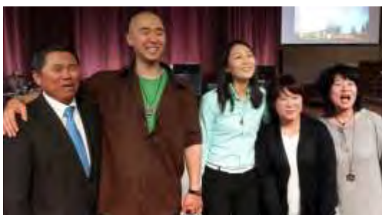
Group visiting Newfoundland from Kumamoto, Japan

After the two earthquakes, many in the congregation moved in to live together. They felt that "Father is living with us."