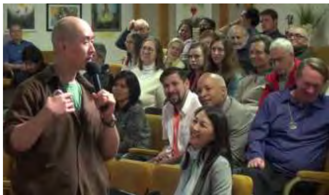
"The Kingdom Nature" May 22, 2016 Sermon