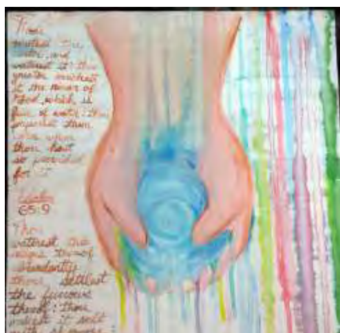
Praise Painting based on Psalm 65_9

Marxism is the opiate of the intellectuals, who often are attracted to central planning and government control by an "enlightened elite" in their own image, but they don't get rid of the monopolies, they become the monopoly, regulating everything. Venezuela is an example of centralized control which promised utopia, but has destroyed people's freedoms and livelihoods. The Tao Te Ching, which is 4,000 years old, taught that the king who rules least is the one that rules best. He does not interfere in peoples' lives.