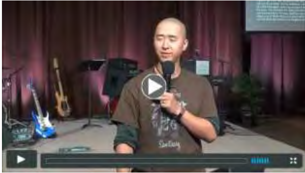
Kingdom Elect - Oct. 23, 2016 - Rev. Hyung Jin Moon

The world is facing a choice that is also encapsulated in the current U.S. Presidential election, to go towards centralized power or towards local sovereignty.