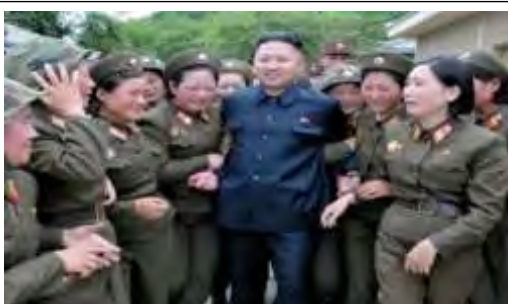
Kim Jong Un with Female Soldiers

True Father met Jesus on Easter morning, beginning the development of his messianic self-consciousness.