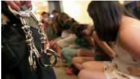
Girls exploited as Sex Slaves for N. Korean dictatorship

Jesus and True Father were strong men. We also should be ready to defend our families at the risk of our lives. In Israel, young men and women are drafted into the military and trained to use weapons for defense of their communities and nation.