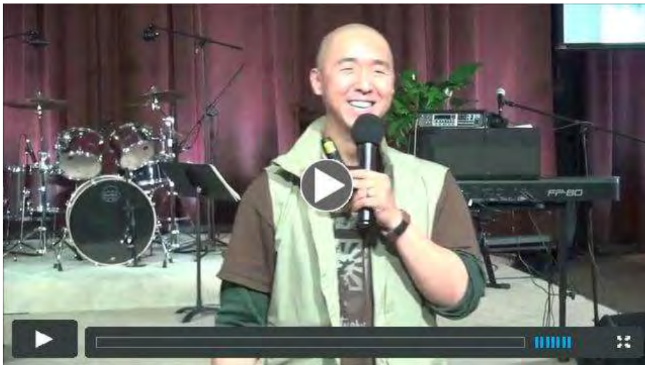
Entrance into the Kingdom - April 16, 2017 - Unification Sanctuary Sermon

Jesus had power over death through his resurrection. We must create a society where predators and bringers of death are afraid. Popular culture brainwashes us to think it's cool to be weak and unarmed. Jesus empowered us to challenge Satan spiritually. Now is the time for us to be able to challenge Satan physically as well.