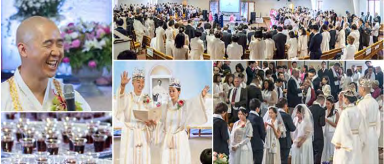
February 28, 2018 "Cheon Il Guk Book of Life Registration Blessing" Ceremony