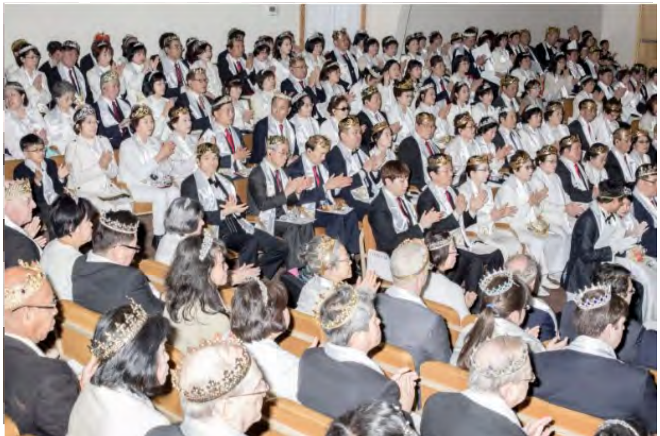
The congregation during a sermon.

This crowd was about twice the usual size because this service was the warm-up for a renewal-of-marriage-vows ceremony scheduled for Wednesday morning. Scores of couples already had arrived from Japan and Korea. That ceremony — officially, the “Cosmic True Parents of Heaven, Earth and Humanity Cheon Il Guk Book of Life Registration Blessing” — would cap a week of activities that thus far had included an arts festival, a survival skills contest and a goat-butchering demonstration.