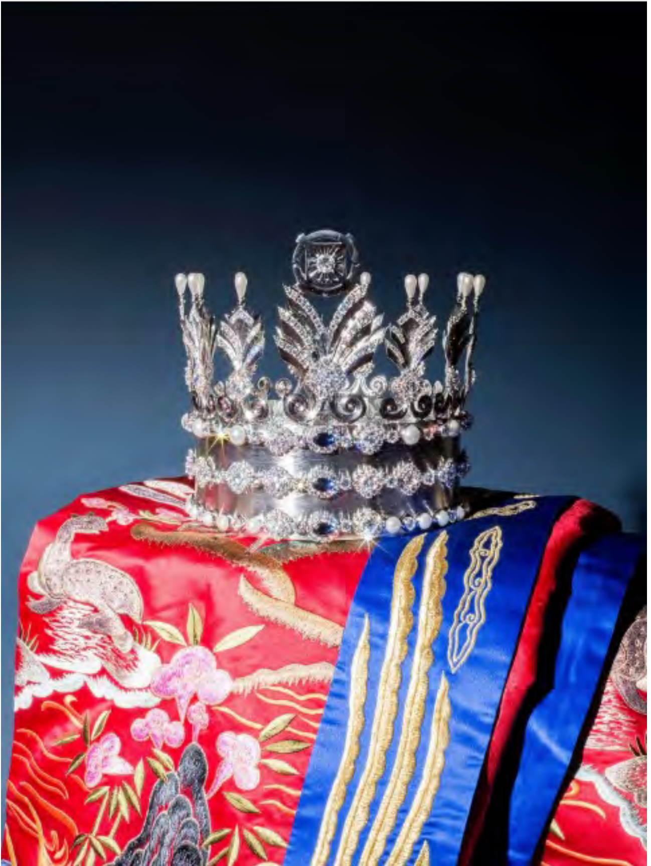
The Rev. Sun Myung Moon's crown sits atop his robe.