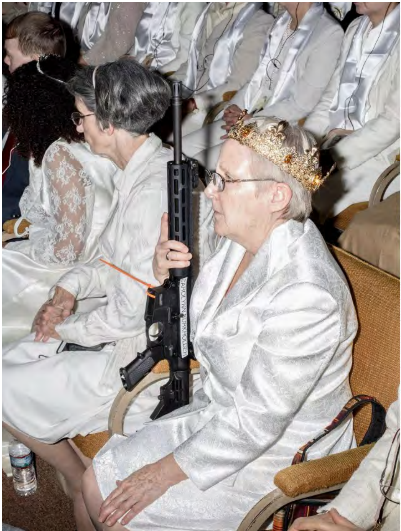
A member of the church holds her assault rifle during a blessing ceremony.