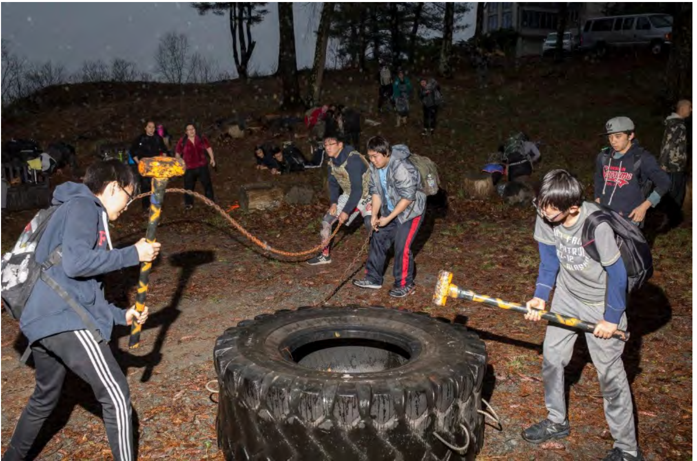
Church members do outdoor circuit training. Some members are part of the church's Peace Police/Peace Militia.