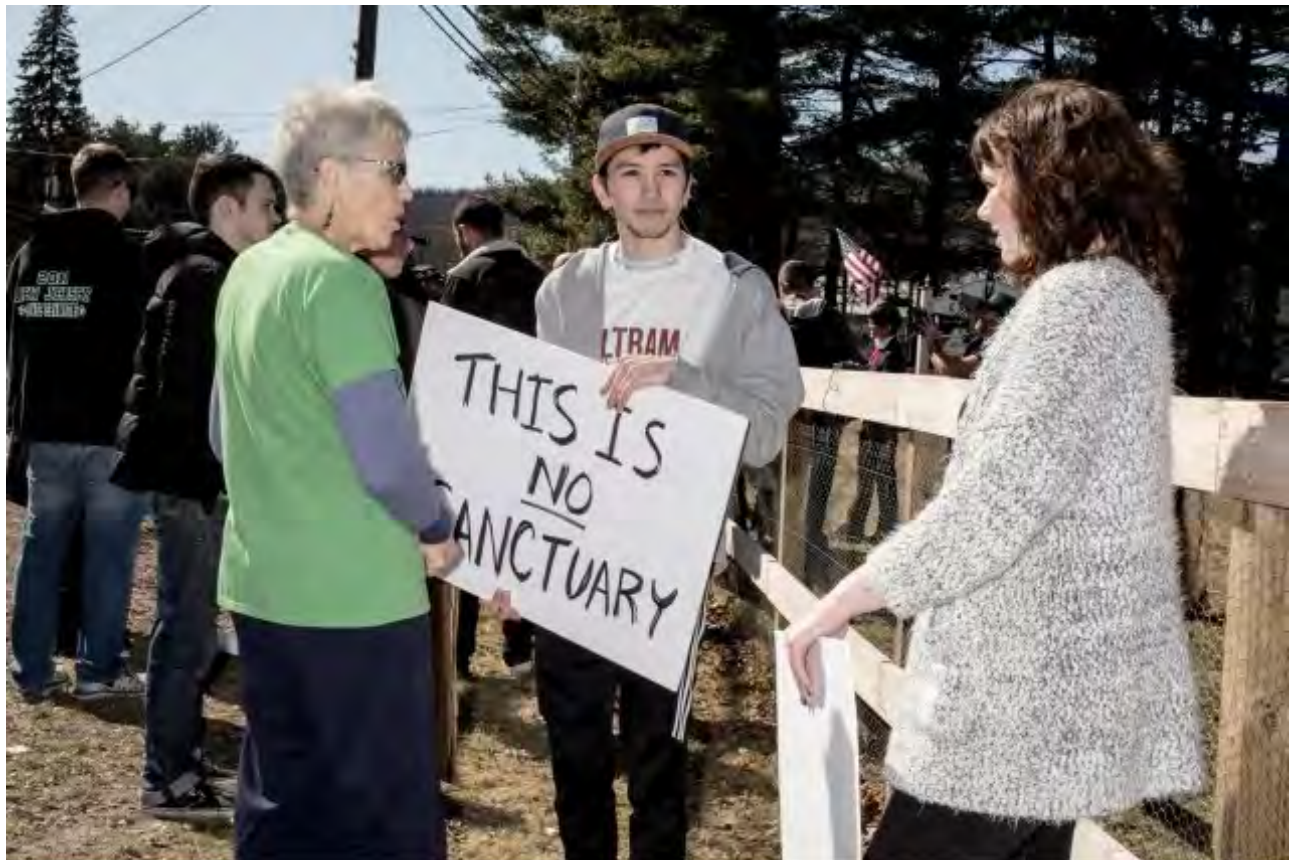
A group of protesters outside Sanctuary Church.

The brides and grooms in attendance, some 500 total, jointly sipped from tiny cups of wine. They took their vows (“Do you promise an eternal bond as husband and wife?”). The King said an extended prayer, acknowledging their “right to sovereignty, the right to keep and bear arms, the right to inherit the earth and protect it from socialism, communism and political Satanism.” Husbands and wives then exchanged rings. The sanctuary filled with applause, then cheers.