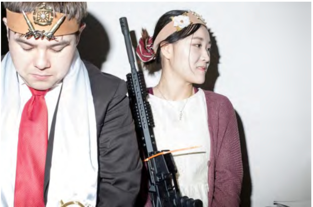
Members of the church during a blessing ceremony in February.