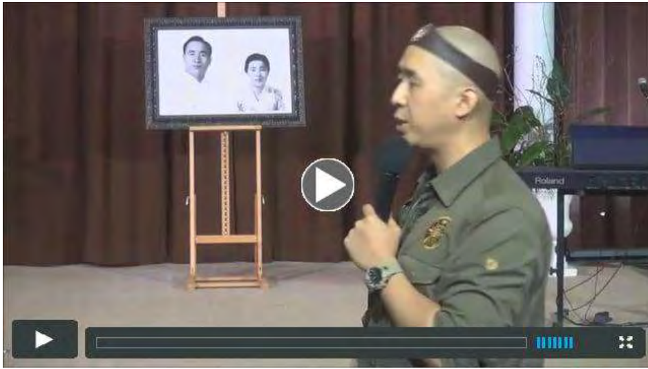
Kingdom of the Rod of Iron 16 - May 20, 2018 - Rev. Hyung Jin Moon - Unification Sanctuary, Newfoundland PA

The ethics of goodness must come in. The heart and the mind precede actions. The rod of iron represents not just a weapon, but more importantly the man and the woman standing up for Christ. The internal fight is first.