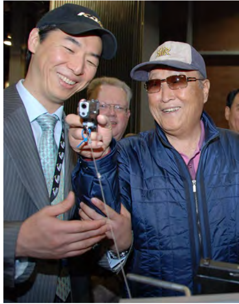
True Father at 2011 Shot Show

Last question -- is the gun in True Father's hand in the accompanying photo, an instrument of evil or an instrument of True Love?