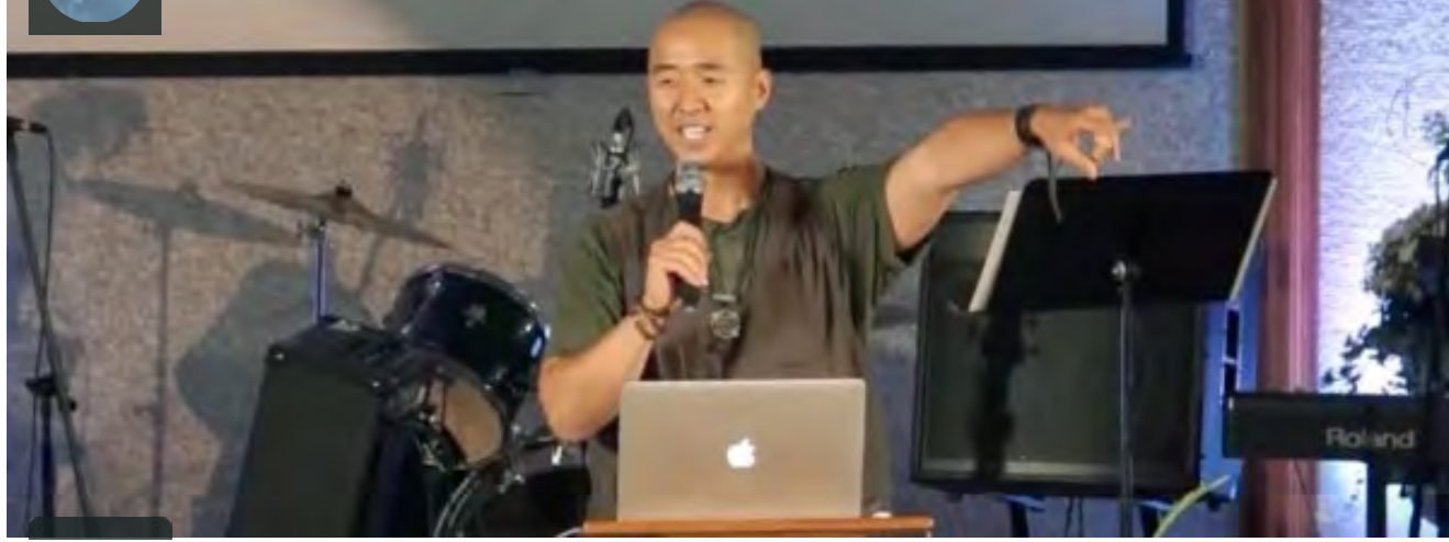
The Mystery of Babylon - Sept. 13, 2015 - Rev. Hyung Jin Moon - Sanctuary Church Newfoundland PA from Unification Sanctuary on Vimeo.