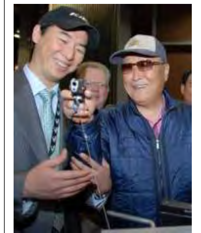
True Father at 2011 Shot Show

SMM, The True Path of Restoration 1-11-72