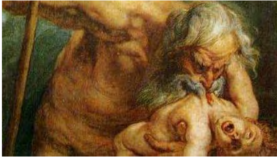
Zeus devouring his son