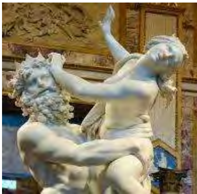
Greek myths include many rapes

Modern feminists attack marriage, but it is what protects women and children from exploitation. Many cultures worship pleasure and beauty, but higher than those are honor, wisdom, and virtue. Marriage uplifted women. No other should receive the husband's attention.