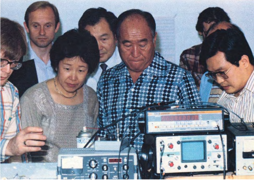
True parents visiting WRIST in July 1985, Father having been recently released from Danbury prison.