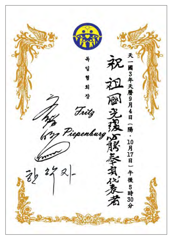
True Mother's calligraphy for Fritz Piepenburg "Congratulation to the representative of dedication for total victory for the restoration of our homeland"

3 year of Cheon Il Guk September 4 of the heavenly calendar, October 17, 2015, 5:15 pm.