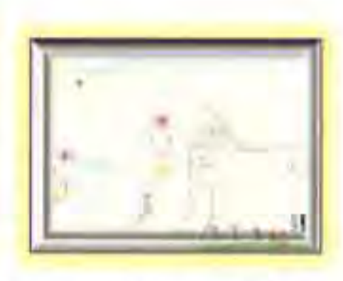
Pictures drawn by Refugee children in the Alte Asfinag Camp Salzburg in February 2016