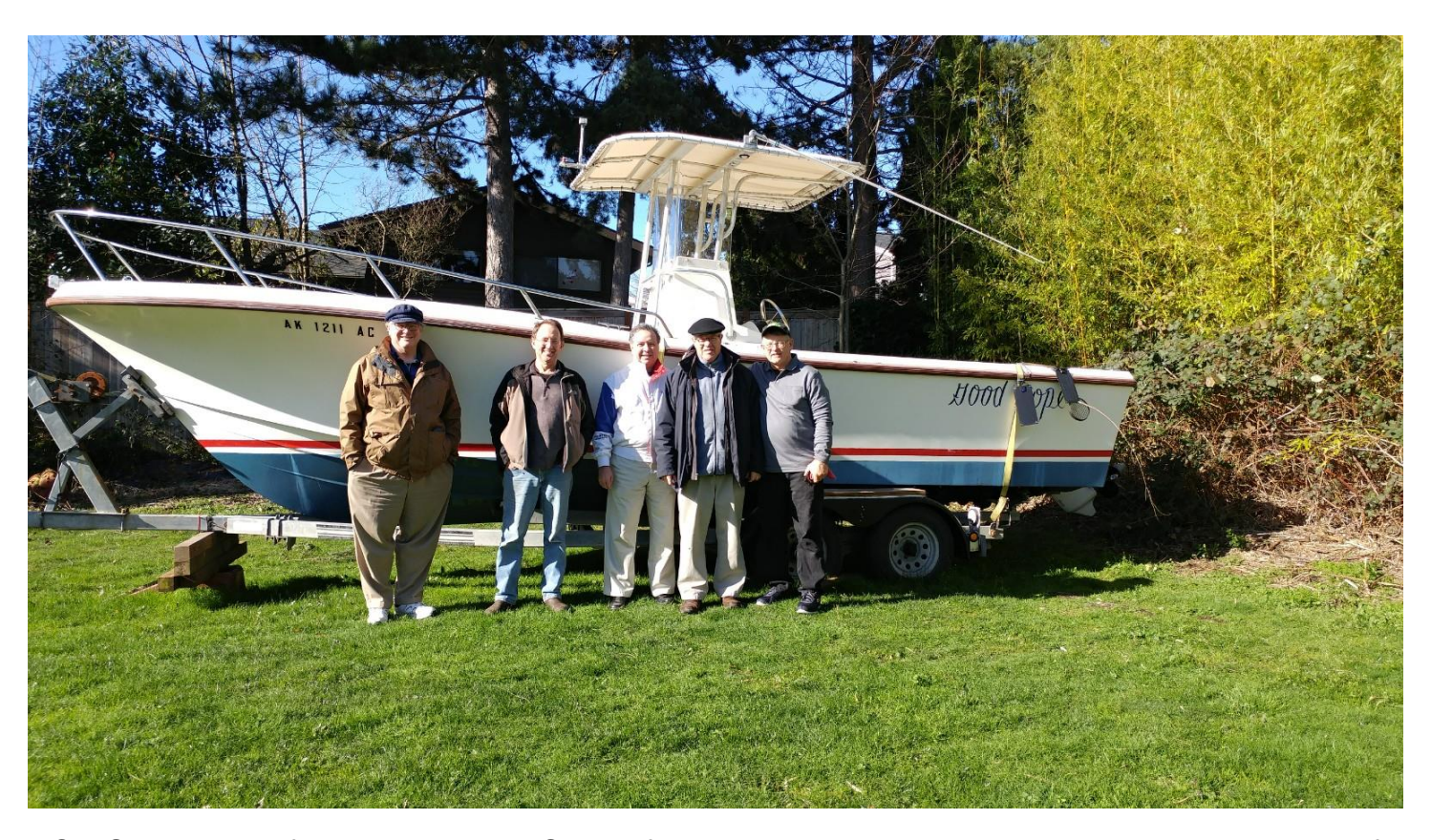
Old Salts looking forward to provide Seattle families time on the water with True Parents lineage of strong safety, fun and inspiration far into the future.