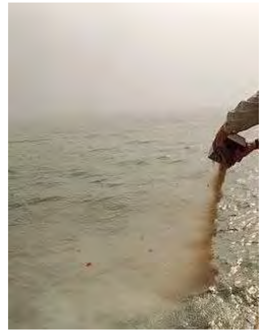
The author scattered the commingled ashes of his parents, per their request, near their Ocean City, MD, home where they lived for many years. It was a beautiful ceremony attended by the family.

"(God) is happy because the moment of the physical body's death is the moment we experience the joy of leaving the finite realm of love in order to enter the infinite realm of love. It is the moment of our second birth. Then is God happier on the day we are born into the physical world, or at that moment we leave our physical body behind? At that moment, we are born a second time into the realm of the infinite expansion of love. We become His new children through death. Of course, God is happier at the second birth. I am telling you this because you need to know that you cannot have a relationship with God unless you are released from the fear of death."