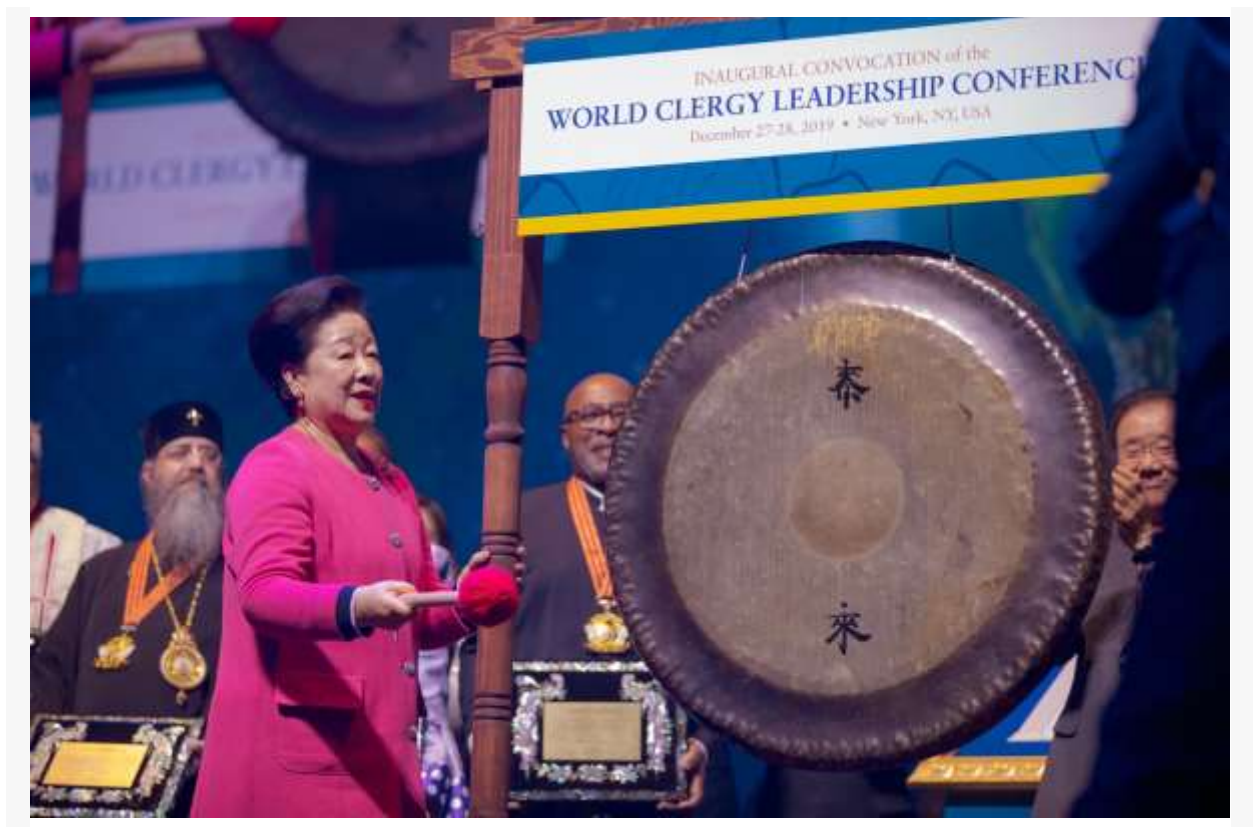
Inauguration ceremony of the World Clergy Leadership Conference at the Prudential Center in New Jersey

Once again, we would very much like to invite you to join us in showing Father and Mother Moon our appreciation for their immense contributions to peace and "give back" to them in the form of a heartfelt written note along with a generous donation on the occasion of their milestone birthdays ideally before February 6th.