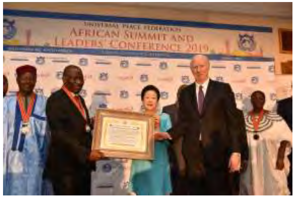
Mother Moon in South Africa

Mother Moon's key point in these gatherings is that we can't resolve our current social ills by human effort alone, but it can only be resolved through the divine intervention of God.