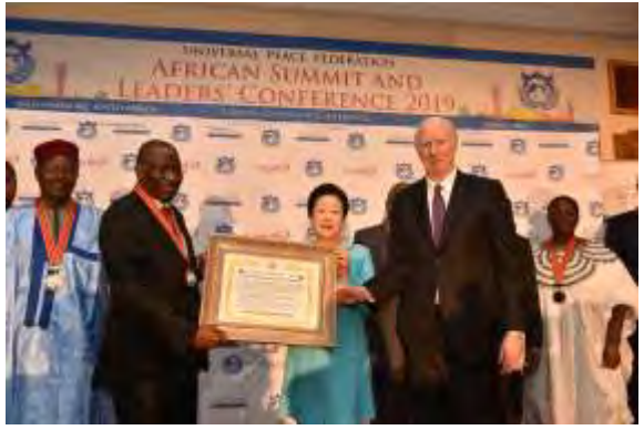
Mother Moon in South Africa

Mother Moon's key point in these gatherings is that we can't resolve our current social ills by human effort alone, but it can only be resolved through the divine intervention of God.