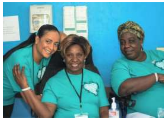
Partnership with Stand Up to Poverty

WFWP works for sustainable peace, through our Leadership of the Heart education, through our Cornerstone for Happiness relationship education, and by networking with like-minded organizations to strengthen our impact.