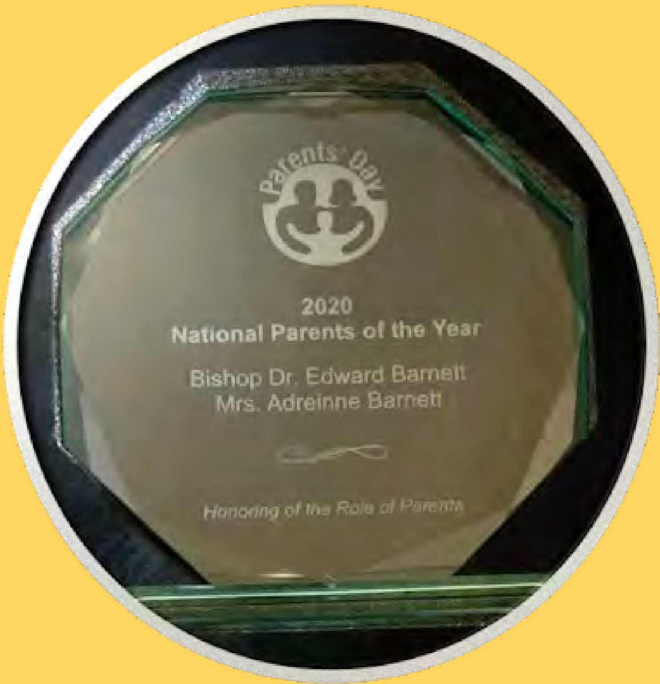
2020 National Parents of the Year Award