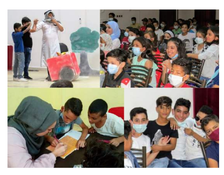
Providing a brighter future to refugee children in Jordan