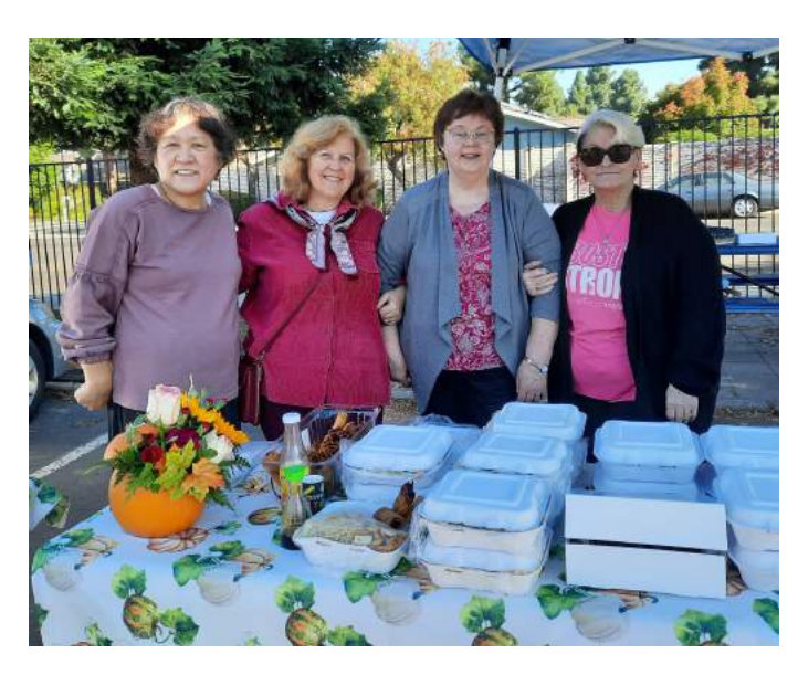
Benefit for Schools of Africa in Northern California

Each year, local chapters and members across the USA organize innovative and engaging events to raise funds for the Schools of Africa Project with ten schools throughout eight African countries. These funds have helped to continually maintain the schools, finance school supplies, improve buildings and classrooms, secure funds for scholarships to low-income students, and much more.