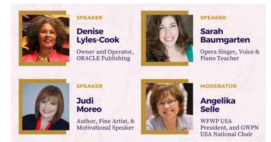
GWPN Forum "Arts and Culture"