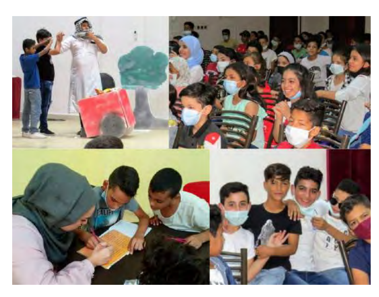
Providing a brighter future to refugee children in Jordan