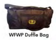
WFWP Duffle Bag