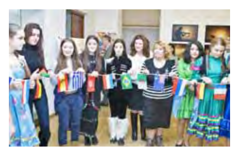
Int'l Day of Tolerance Observation 2012 - Moscow