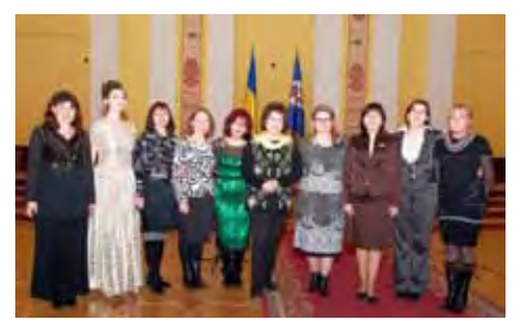
16-Day Campaign in Cooperation with Kiev City