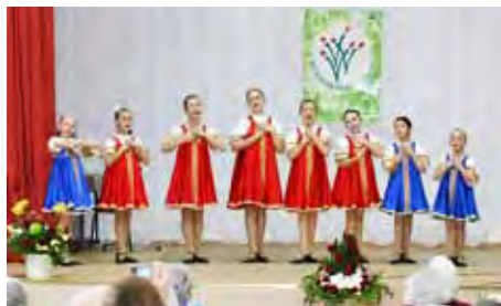
Spring Week of Kindness - Concert for War Veterans