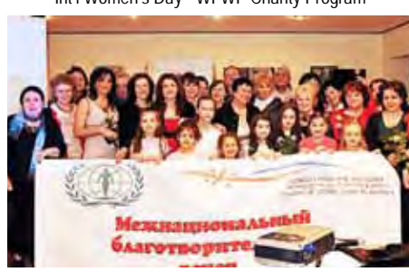
Int'l Women's Day - WFWP Charity Program