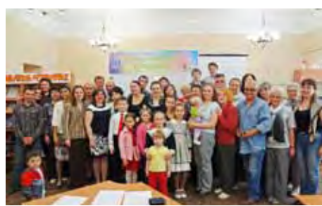
Int'l Family Day Celebration