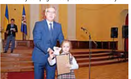
Project with Kiev City contd.