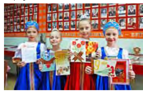
Congratulatory Cards for War Veterans