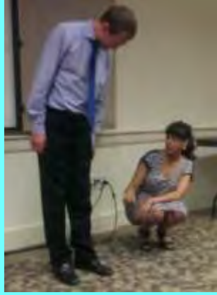
On men's shoes

The presentation was lively, interactive, and so enjoyable. After the general presentation on appearance and manners, men and women split into separate breakouts to further discuss best practices. Participants continued to rave that this session was lots of fun, memorable, and a perfect way to finish the day with the theme "Inherent Value and Esteem."