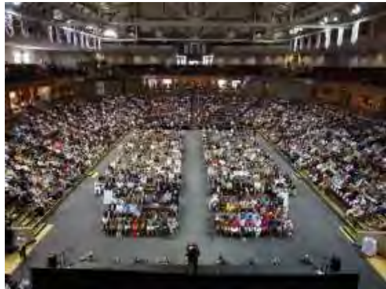
City-wide prayer vigil

"History is calling for reconciliation, love, service, and sacrifice. Today's problems cannot be solved by the logic of power, but by the logic of love." Dr. Hak Ja Han Moon