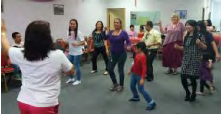
Learning new dance moves!

fundraiser event dubbed a "Dance-A-Thon" to help support victims of the recent earthquake in Nepal. It was held at the Elizabeth Family Church in Elizabeth, New Jersey on May 16, 2015.